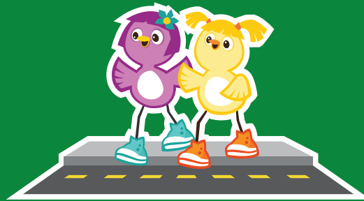
CRUCEMOS LA CALLE (LET'S CROSS THE STREET)