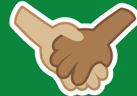
AGÁRRAME LA MANO (HOLD MY HAND)